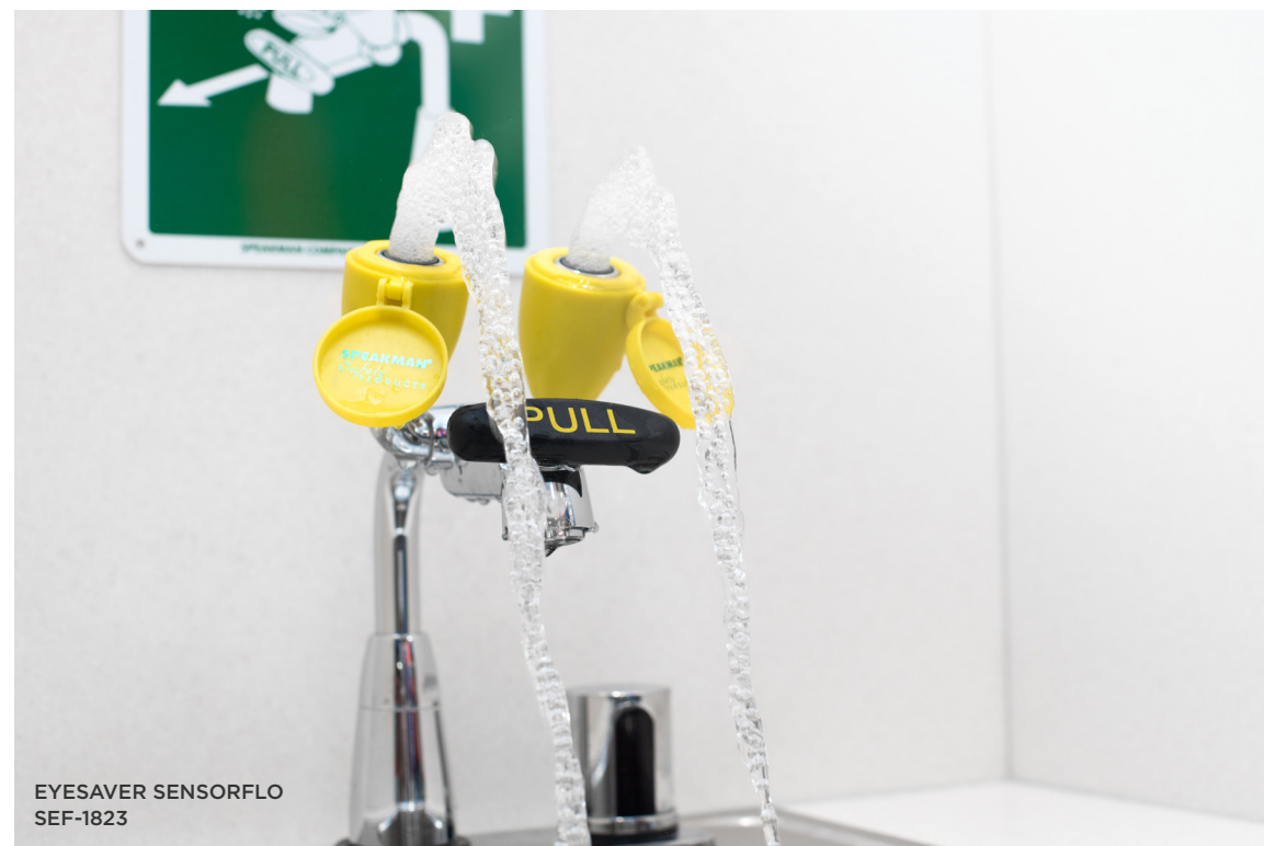
EYESAVER SENSORFLO SEF-1823